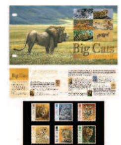
10 Presentation Packs