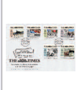
12 Cachet Cover