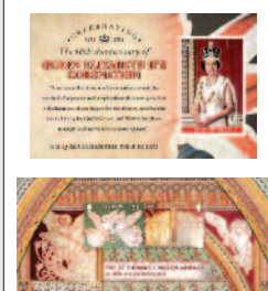
5 Miniature Sheet