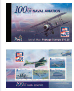
15 Prestige Booklets