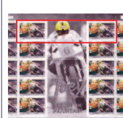
3 Gutter Pairs