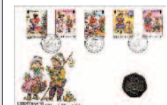
13 Philatelic Numismatic Cover (PNC)