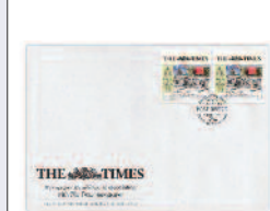
20 Europa First Day Cover