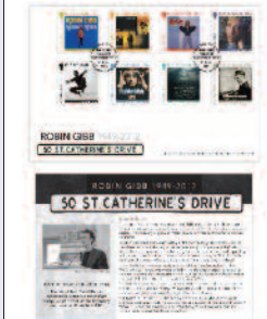
11 First Day Cover