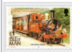
16 Stamp Card