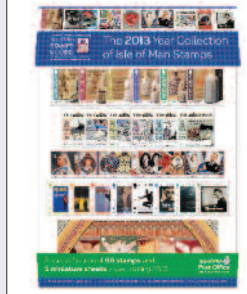
24 Year Set