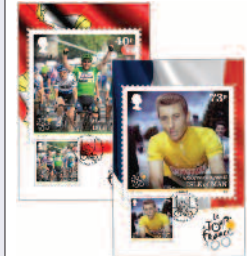
17 Maximum Card