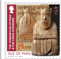
1 Mint Stamps