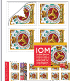
4 Self Adhesives