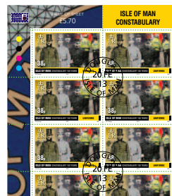
2 Cancelled to Order (CTO)