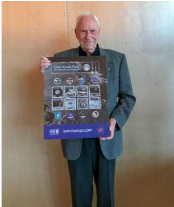
AI Worden (Apollo 15 Astronaut)