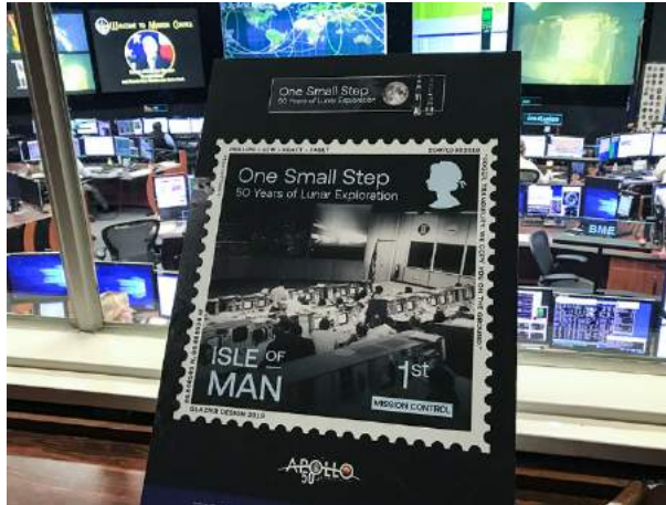
The Mission Control Stamp in Johnson Space Center Mission Control