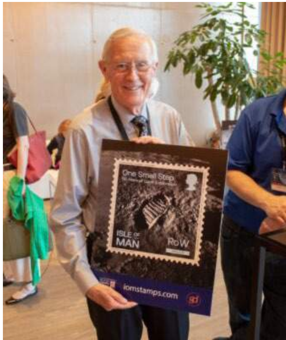
Charlie Duke Apollo 16 Astronaut