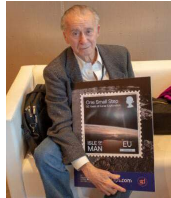
Walt Cunningham Apollo 7 Astronaut