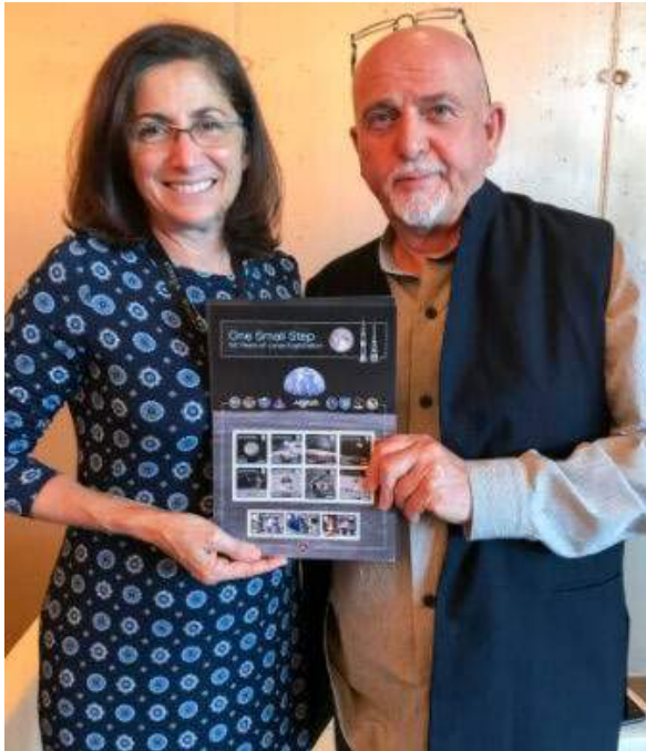
Nicole Stott (former NASA Astronaut) & Peter Gabriel (Musician)