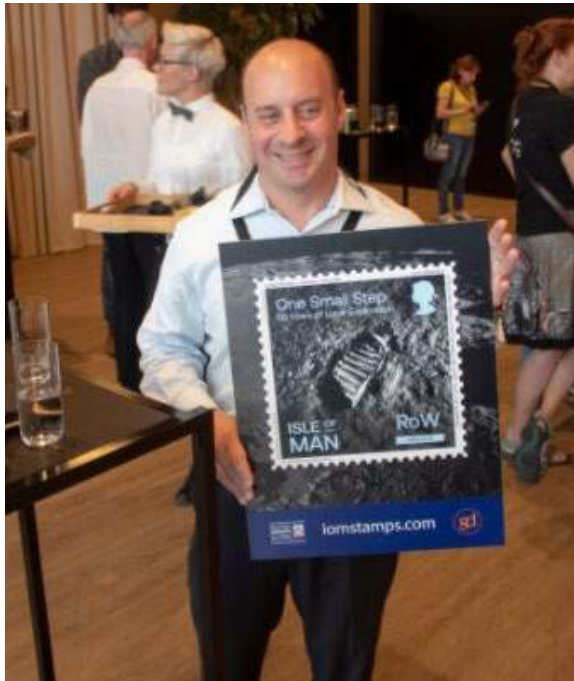
Garrett Reisman (former NASA Astronaut & Director of Space Operations SpaceX)