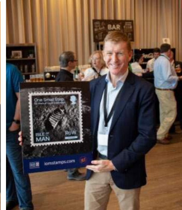
Tim Peake (ESA Astronaut)