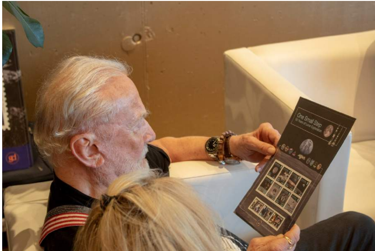
Buzz Aldrin (Apollo 11 Astronaut and second man to walk on the Moon)