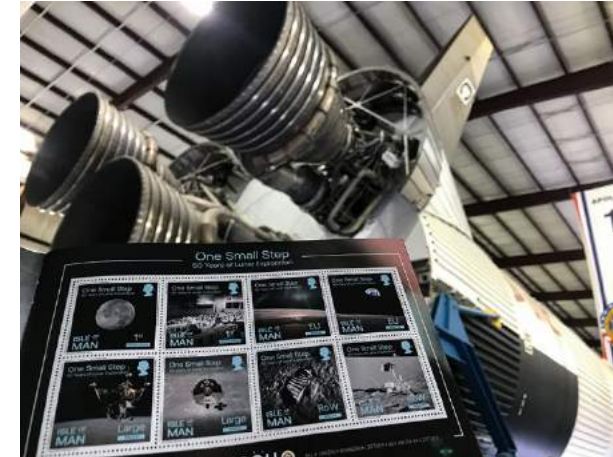
The Stamp Set & Apollo 18