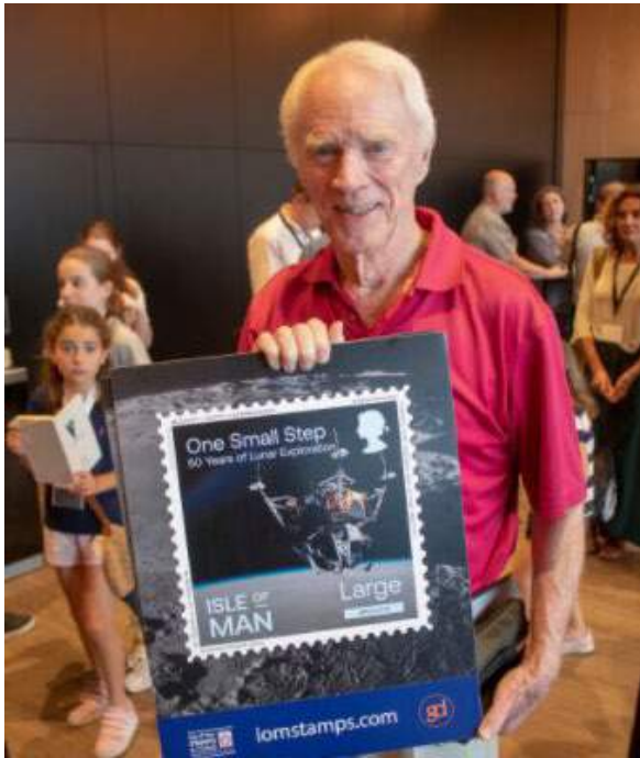
Rusty Schweickart Apollo 9 Astronaut